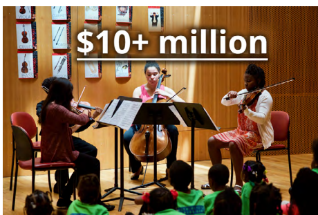
IN AWARDS AND SCHOLARSHIPS