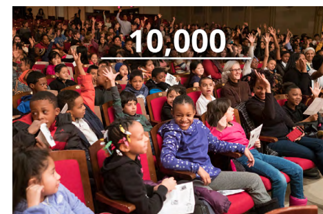
REACHED THROUGH ANNUAL PROGRAMMING AND 2 MILLION IN LIVE AND BROADCAST AUDIENCES

Make a gift today that will shape the future of classical music. A future where the field looks like our communities: where every young person has the opportunity to express themselves and learn classical music; where audiences reflect the people we see on our streets; and where leadership—on stage and off—includes all voices.