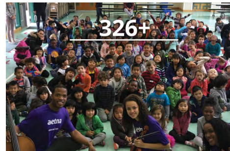
PARTNERS ACROSS THE COUNTRY