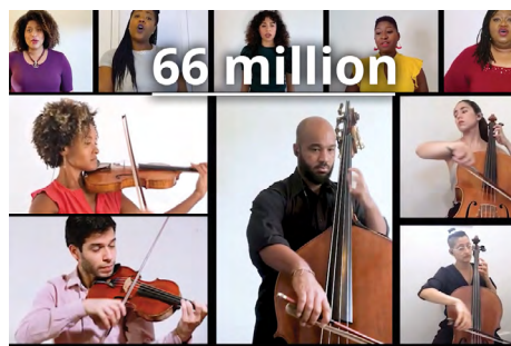
REACHED THROUGH MEDIA AND DIGITAL PROGRAMMING