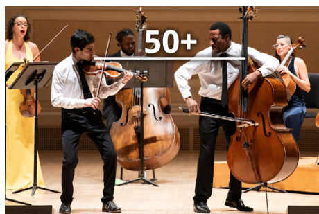
COMMISSIONED WORKS BY BLACK AND LATINX COMPOSERS