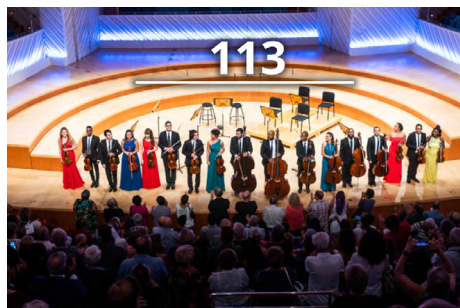
SPHINX ORCHESTRAL PARTNERS