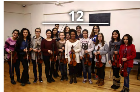
COUNTRIES REACHED THROUGH GLOBAL PROGRAMMING