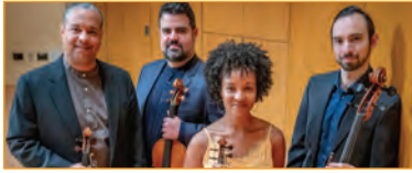
Grammy award-winning Harlem Quartet signed to the Epstein Fox Performances (EFP) roster