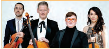
Grammy-nominated Catalyst Quartet joined the Arts Management Group (AMG) roster