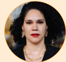
JESSIE MONTGOMERY Best Contemporary Classical Composition